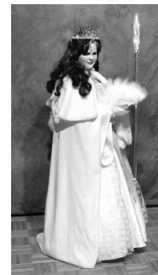
That guy is totally gonna nom.

Settle down, kids - I'll win next year. You know, when these things actually let me FLY.