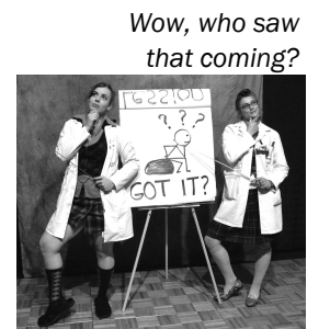
Wow, who saw that coming?