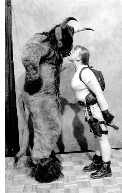
What a nin-cow-poop!